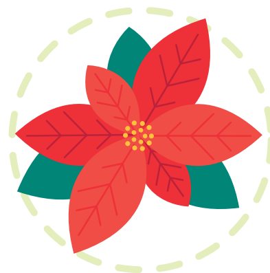
bico-de-papagaio ou flor-do-natal