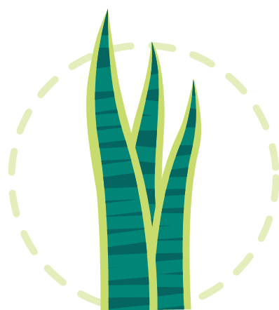
espada de S. Jorge